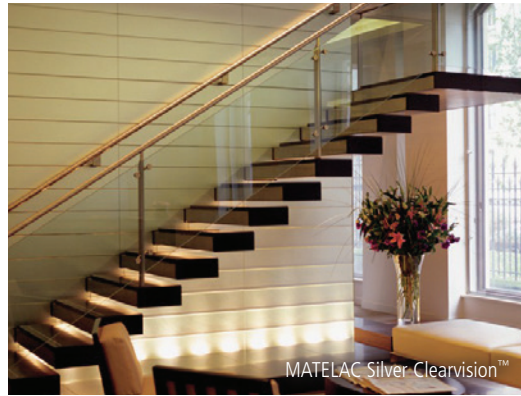
MATELAC Silver Clearvision™